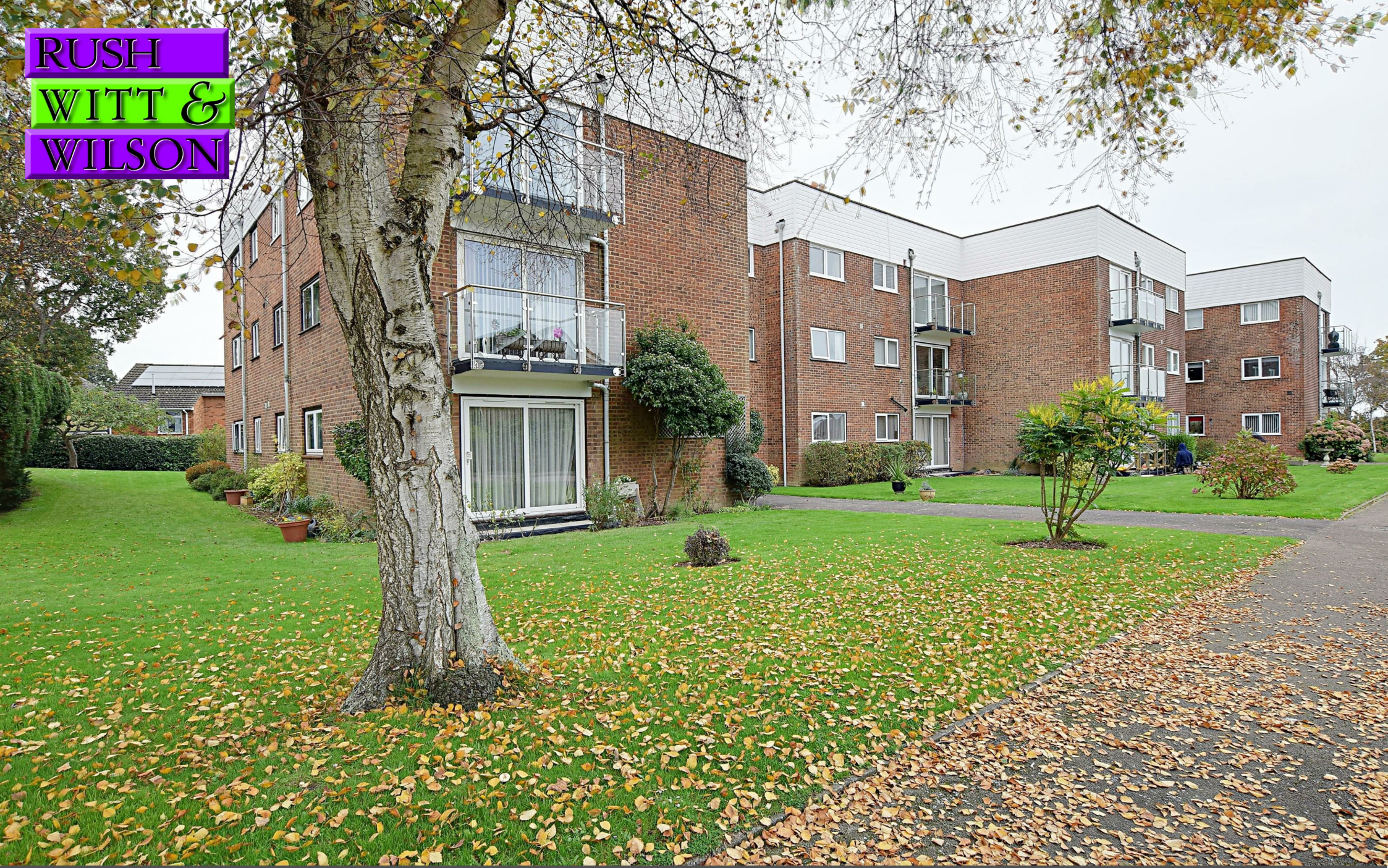
17 Ismay Lodge Heighton Close, Bexhill-On-Sea, East Sussex TN39 3UT £199,950